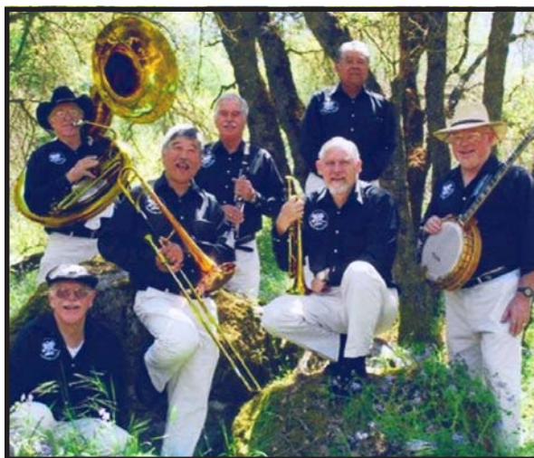
High Sierra Jazz Band travels from Three Rivers, CA to join the November Thanksgiving fun!

Four excellent local San Diego bands (plus one from a little farther away) are also in the lineup for Festival #31: Uptown Rhythm Makers, South Bay Jazz