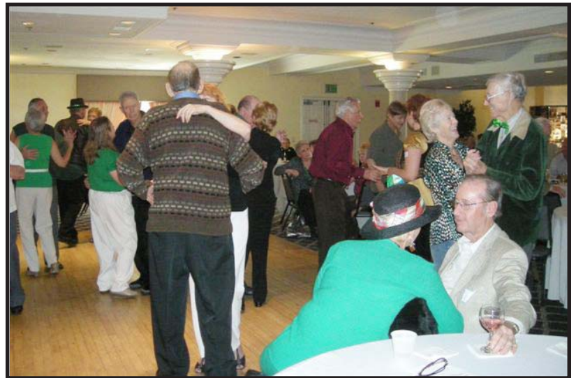
The dance floor was full at the March concert