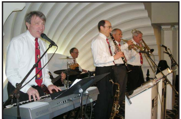
High Society plays at the February concert