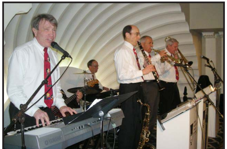
High Society plays at the February concert