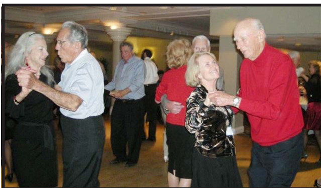
Couples enjoy the music of High Society in February