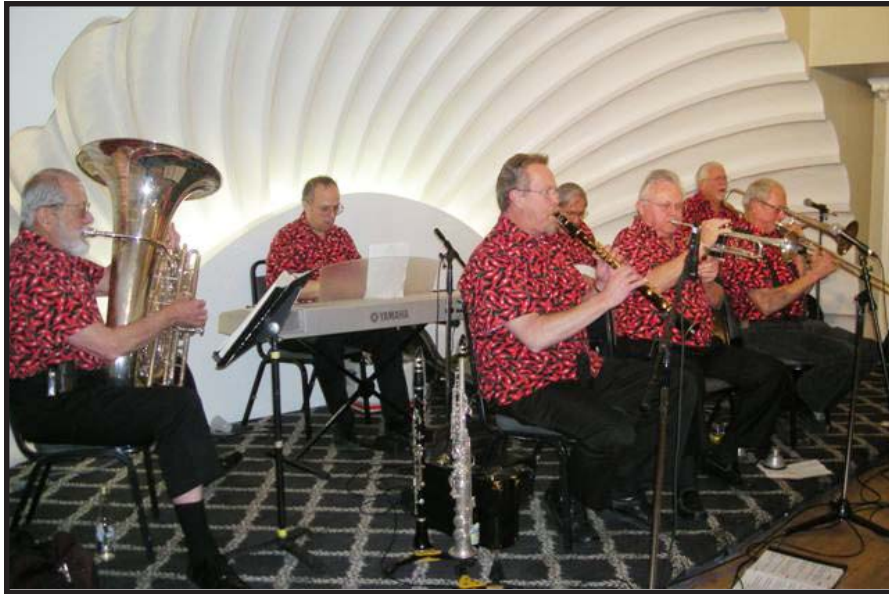
Red Pepper Jazz Band performs at the March monthly concert