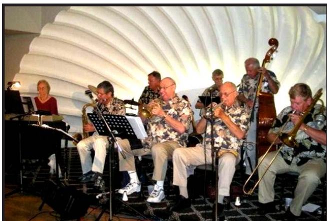
South Bay Jazz Ramblers made it happen in August.