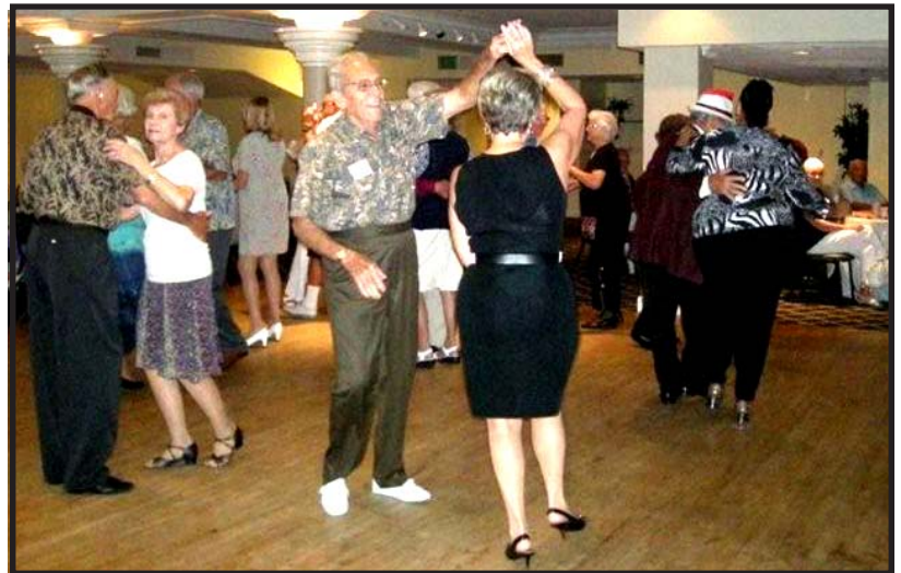
More dancers enjoying our monthly concerts.