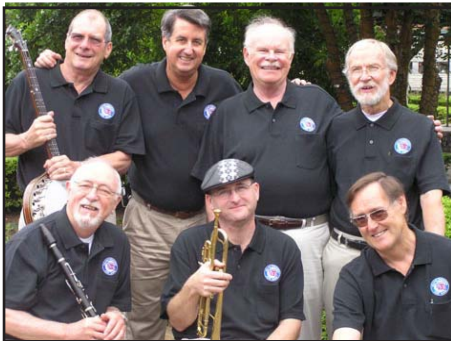
Grand Dominion returns to the 30th Annual Festival.

The amount of first-class talent at Festival No. 30 is truly remarkable. This will definitely be a weekend to remember!