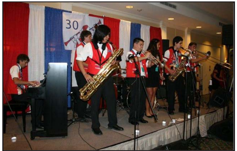
Mission Bay High School Dixie Band performing.