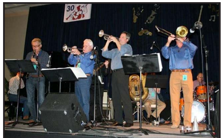
Yerba Buena Stompers delighting its audience.