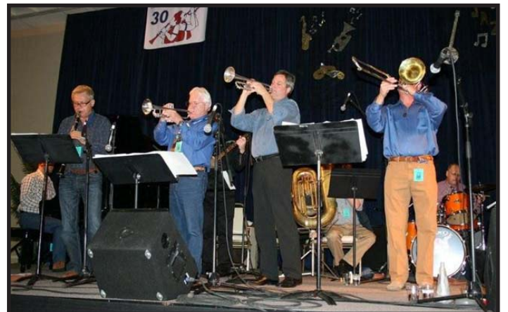
Yerba Buena Stompers delighting its audience.