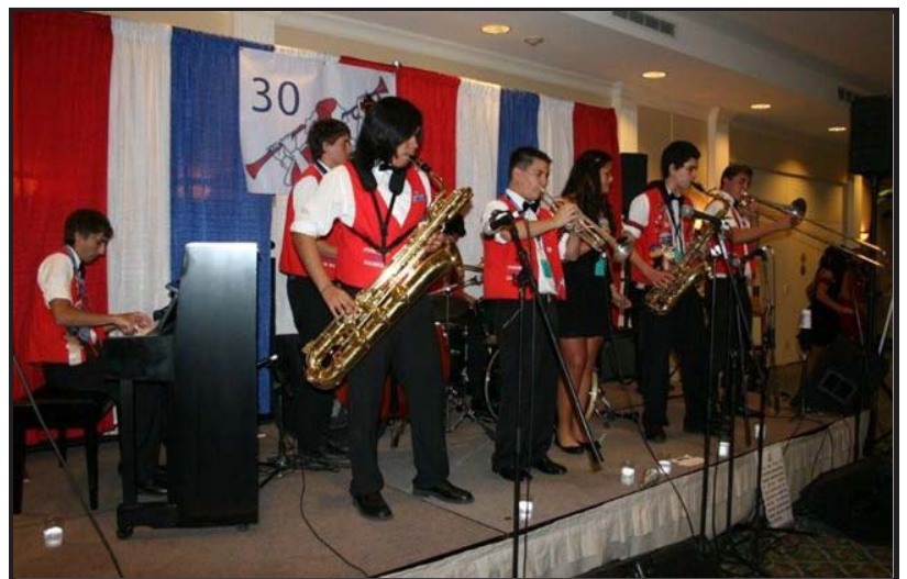
Mission Bay High School Dixie Band performing.