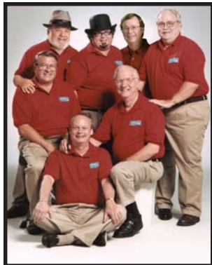
Cornet Chop Suey