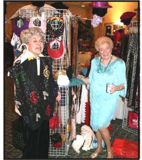
Racy Ltd. clients dressing up!