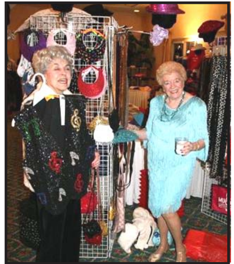
Racy Ltd. clients dressing up!