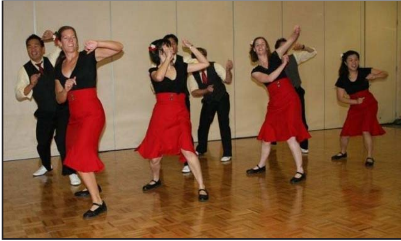
2 to Groove doing some shim-shamin'.