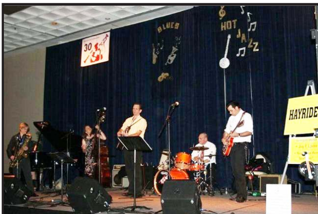
Hayriders rockin' to large crowds.